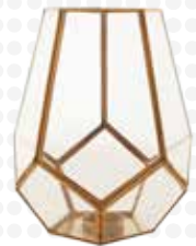
Polished brass Pentagonal tealight holder , £14, Tesco Home