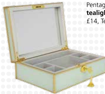
Esther trinket box , £29.50, Marks & Spencer