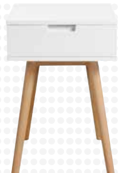
Tretton bedside table , £89.99, My Furniture