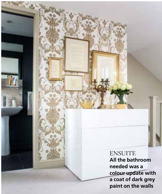
ENSUITE All the bathroom needed was a colour update with a coat of dark grey paint on the walls